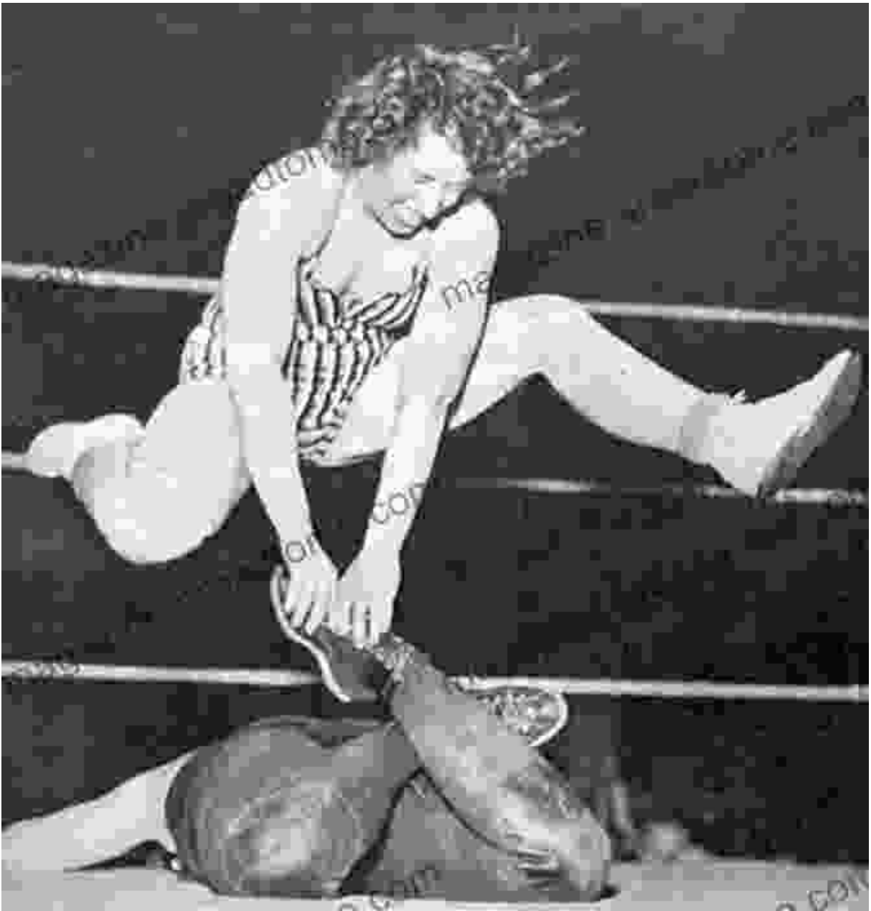
Mildred Burke and The Great Gama in their mixed tag team match.

Mildred Burke was another pioneering female wrestler. She held the World Women's Championship for a record 10 years, and she was inducted into the WWE Hall of Fame in 2016. In 1955, Burke defeated The Great Gama, a legendary Indian wrestler, in a mixed tag team match. This was a major upset, and it helped to prove that female wrestlers could compete against male wrestlers on an equal footing.