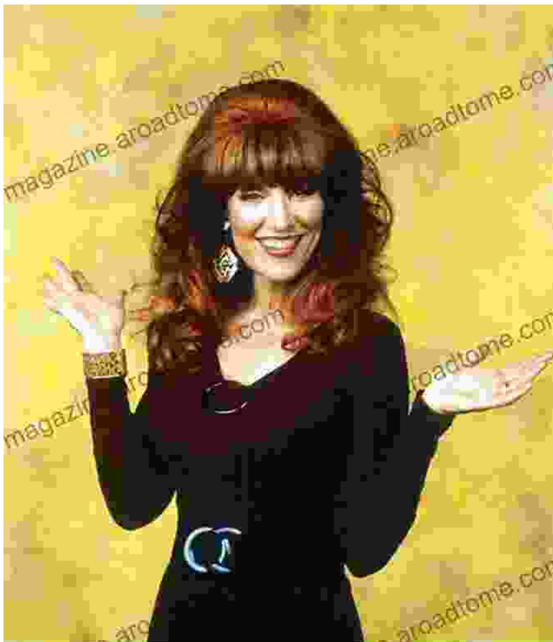
Katey Sagal as Peggy Bundy in Married... with Children

Katey's memoir is not just a chronicle of her musical career. It is a deeply personal exploration of her life as a woman, mother, and artist. She candidly shares her experiences with love, loss, and the challenges of navigating the entertainment industry. Through her reflections, Katey emerges as a relatable and inspiring figure, reminding us of the resilience and determination it takes to live a fulfilling life.