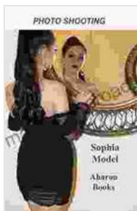
Photo Shooting - Sophia Model: Sexiest Models on the Planet, Gorgeous Fitness Models, Top Models, Fitness Girls, and International Glamor Models. (Photo poses, lingerie, boudoir photos. Book 4)

Step into the world of fashion and glamour as we explore the captivating art of photographing models. Through a series of expertly crafted chapters, you'll master the techniques and strategies used by top photographers to capture stunning images that tell a story and evoke emotion.