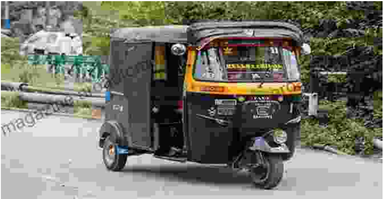
Image 2: The iconic Mumbai auto-rickshaw, a ubiquitous sight in the city's bustling streets.

Mumbai, auto-rickshaws, with their distinctive three-wheeled design and colorful decorations, weave through traffic like a vibrant tapestry.