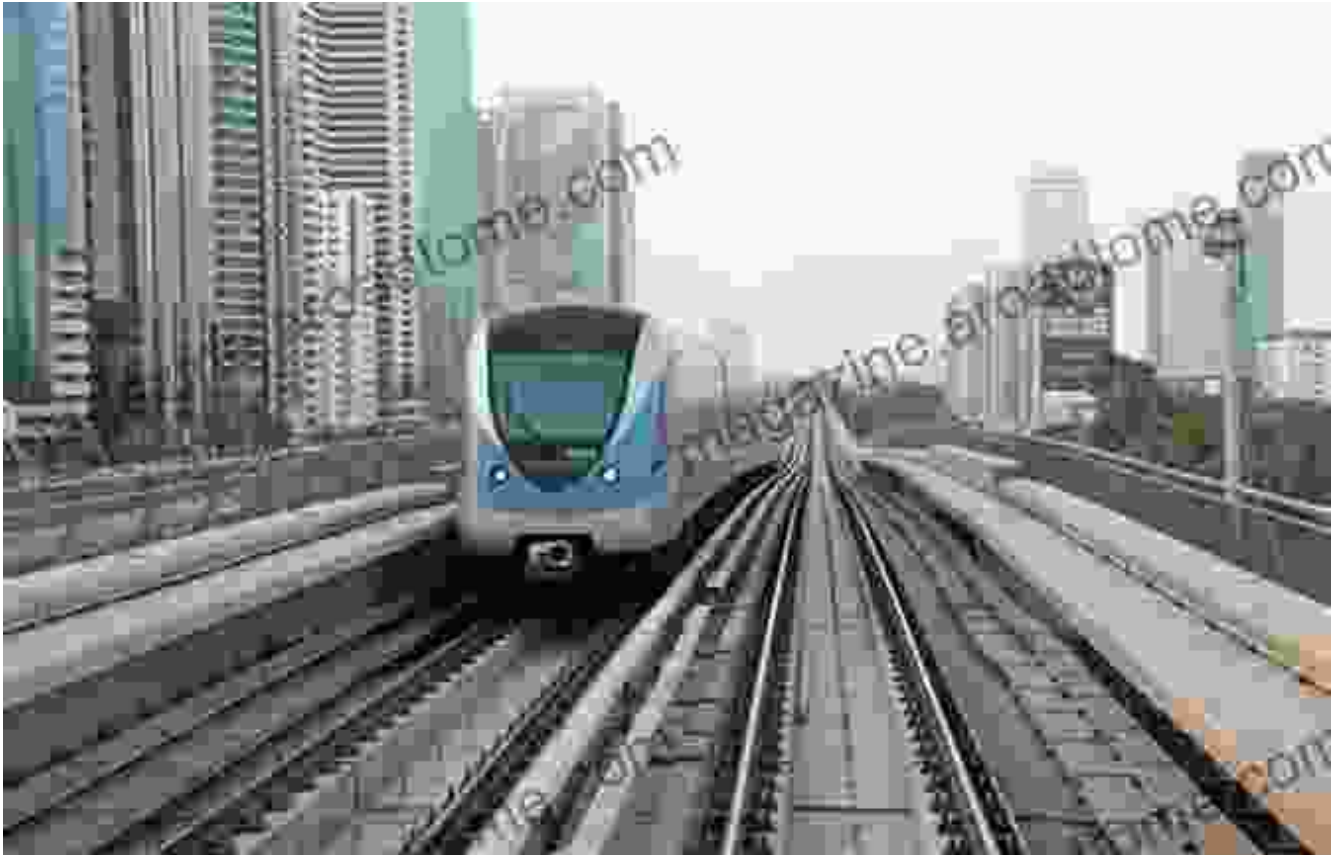
Image 5: Dubai's sleek driverless metro, a symbol of the city's embrace of modern technology.

Dubai, United Arab Emirates, a city of towering skyscrapers and cutting-edge technology, presents a stark contrast to traditional transportation. The city's state-of-the-art infrastructure includes a driverless metro system and an extensive network of highways.